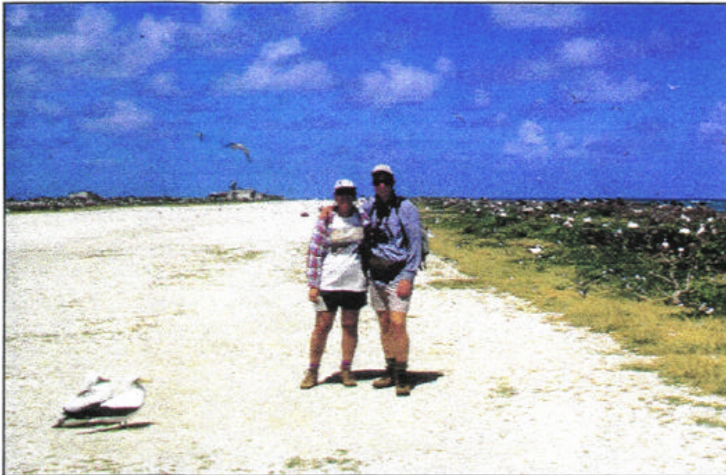
Fig. 4. Barren runway (with scattered Spergularia ) and vegetated non-runway area ( Sporobolus pyramidatus just off runway and row of Tournefortia trees behind). Masked boobies look on - Tern Island.