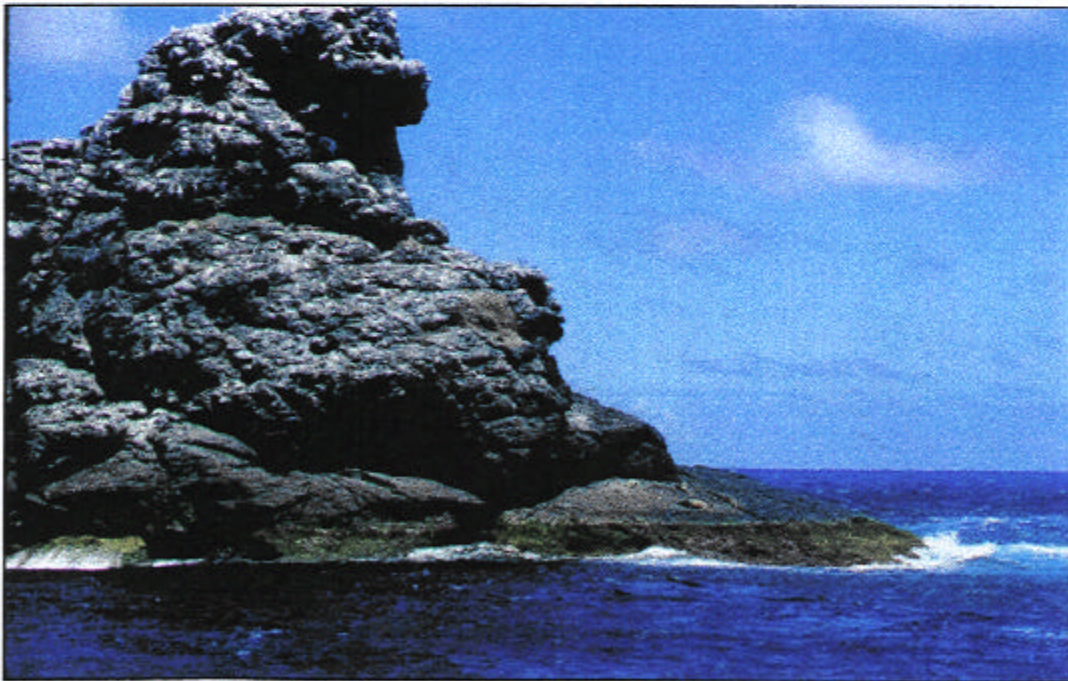
Fig. 2. Close up of Gardner Pinnacles with seals hauled out on ramp on right side of rock and dike running up left side of rock.