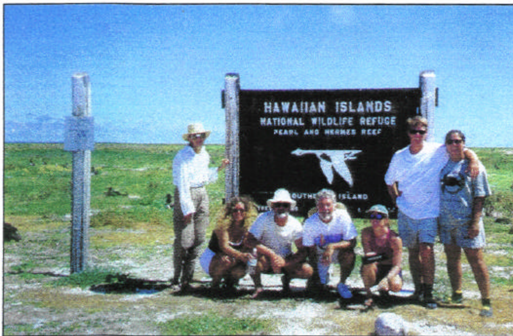
Fig. 16. Refuge sign after restoration by Ron Walker – Southeast Island, Pearl and Hermes Atoll.