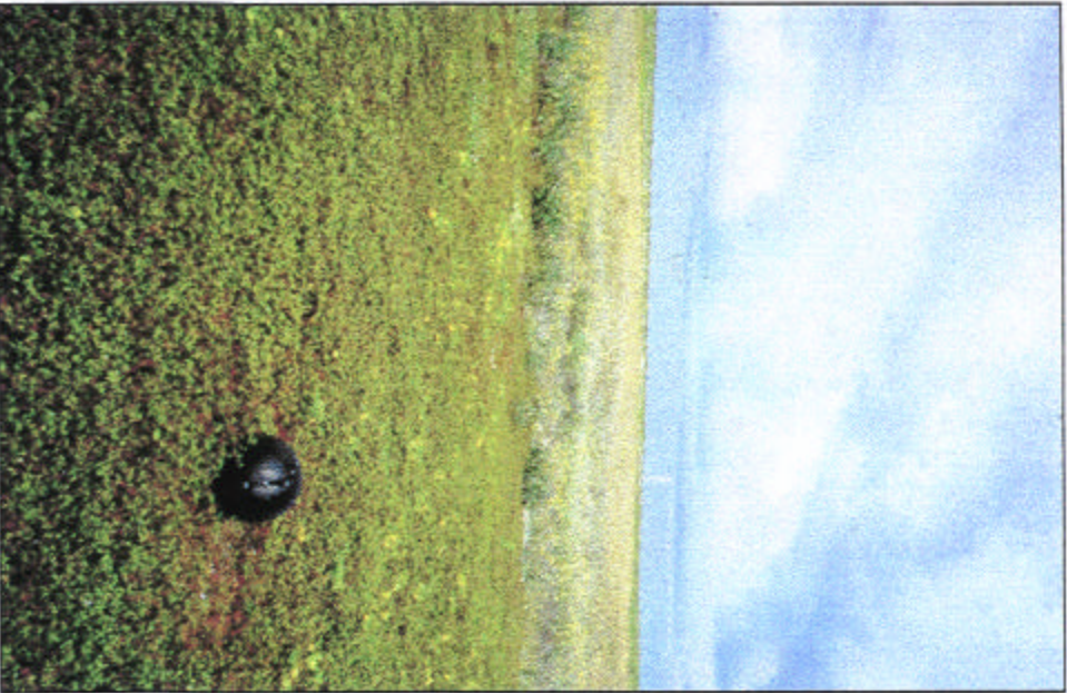
Fig. 20. Sesuvium portulacastrum and plastic float in foreground. Verbesina encelioides in background -- Southeast Island, Pearl and Hermes Atoll.