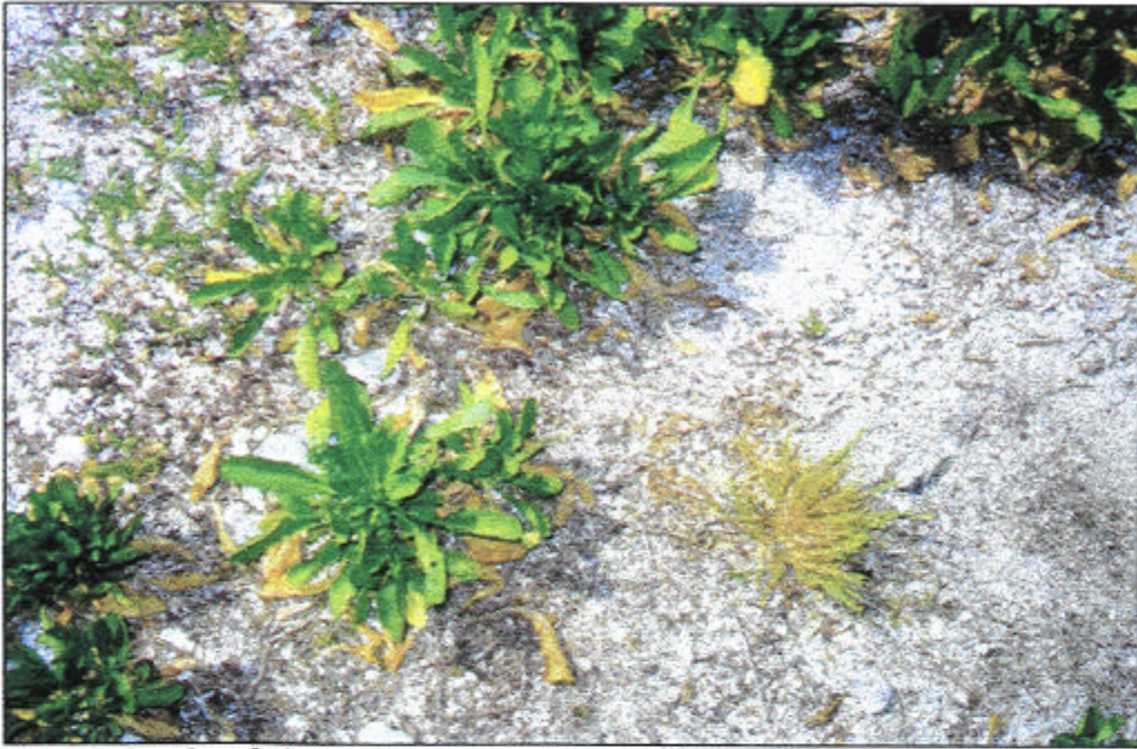
Fig. 17. Lepidium bidentatum var. o-waihiense and Eragrostis paupera – Southeast Island, Pearl and Hermes Atoll.