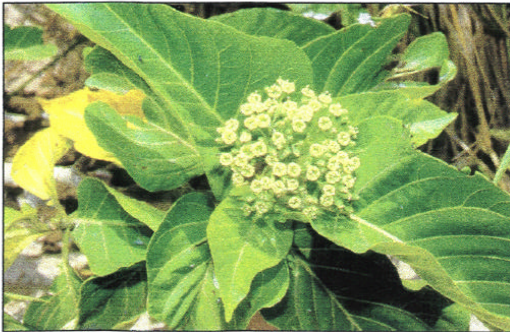
Fig. 14. Pisonia grandis close up – Lisianski Island