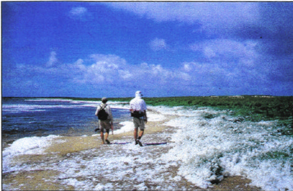
Fig. 9. Foam from the lagoon. Cyperus laevigatus on right with Eragrostis variabilis in the distance – West side of lagoon, Laysan Island.