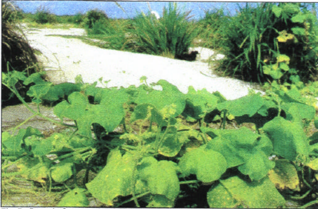
Fig. 7. Sicyos in foreground and Christmas shearwater nesting under Eragrostis variabilis in background – Laysan Island.