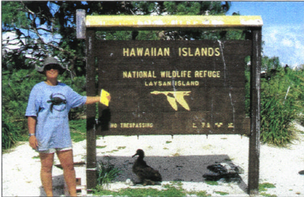
Fig. 5. Refuge sign with lone ironwood tree in background – Laysan Island.