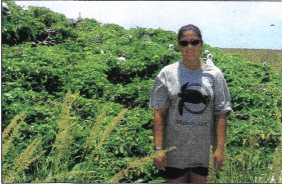
Fig. 13. Pisonia grandis tree with red footed booby chicks. Eragrostis in foreground and background – Central portion of Lisianski Island.