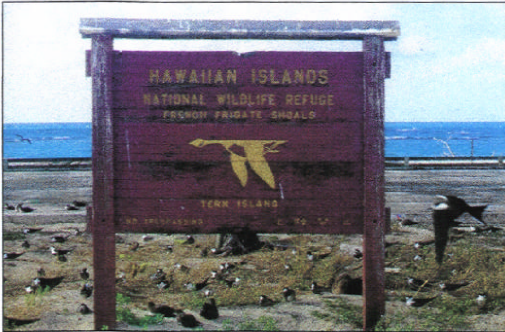
Fig. 3. Sooty terns --Tern Island, French Frigate Shoals.