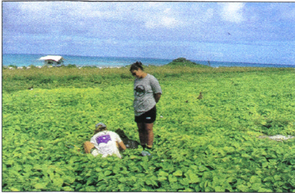
Fig. 11. Concentric zonal pattern of Ipomoea indica / Sicyos vegetation type in foreground and Eragrostis type in background. Camp and a Tournefortia tree can be seen in distance – West coast of Lisianski Island.