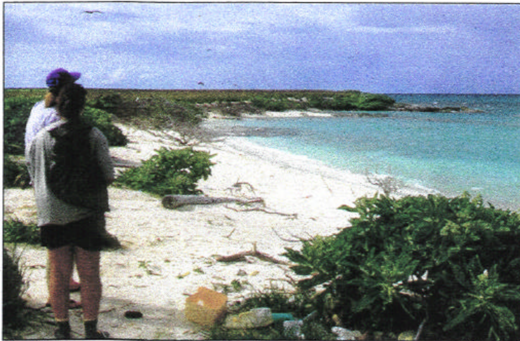
Fig. 12. The cove with Tournefortia trees along coast and Eragrostis grassland inland – East coast of Lisianski Island.