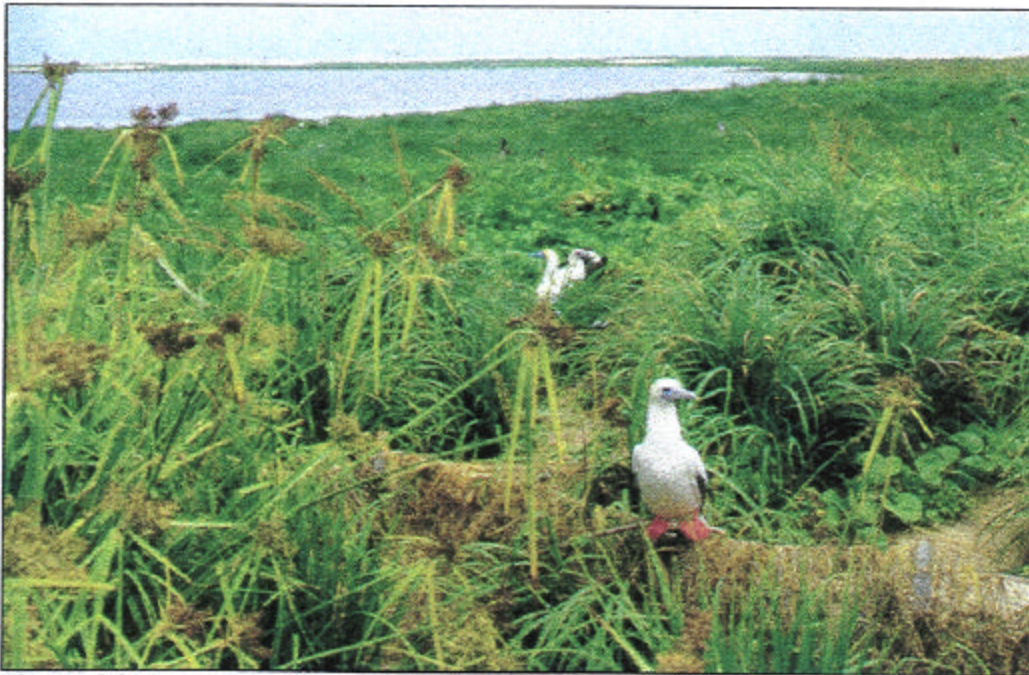
Fig. 8. Mariscus pennatiformis subsp. bryanii with red footed boobies – South shore of lagoon, Laysan Island.