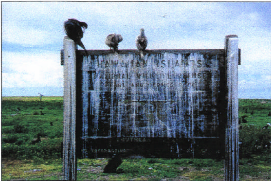
Fig. 15. Refuge sign before restoration by Ron Walker– Southeast Island, Pearl and Hermes Atoll.