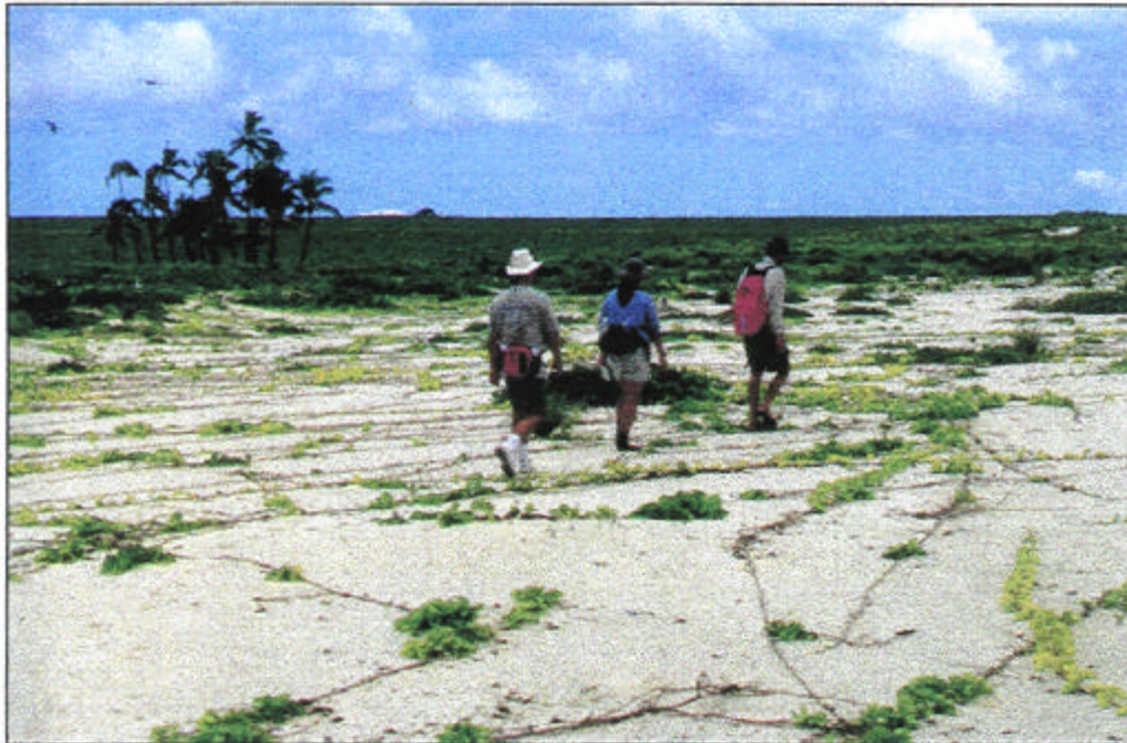
Fig. 6. Ipomoea pes-caprae and clumps of Scaevola less than a meter tall in foreground with Cocos nucifera and camp in background – Laysan Island.