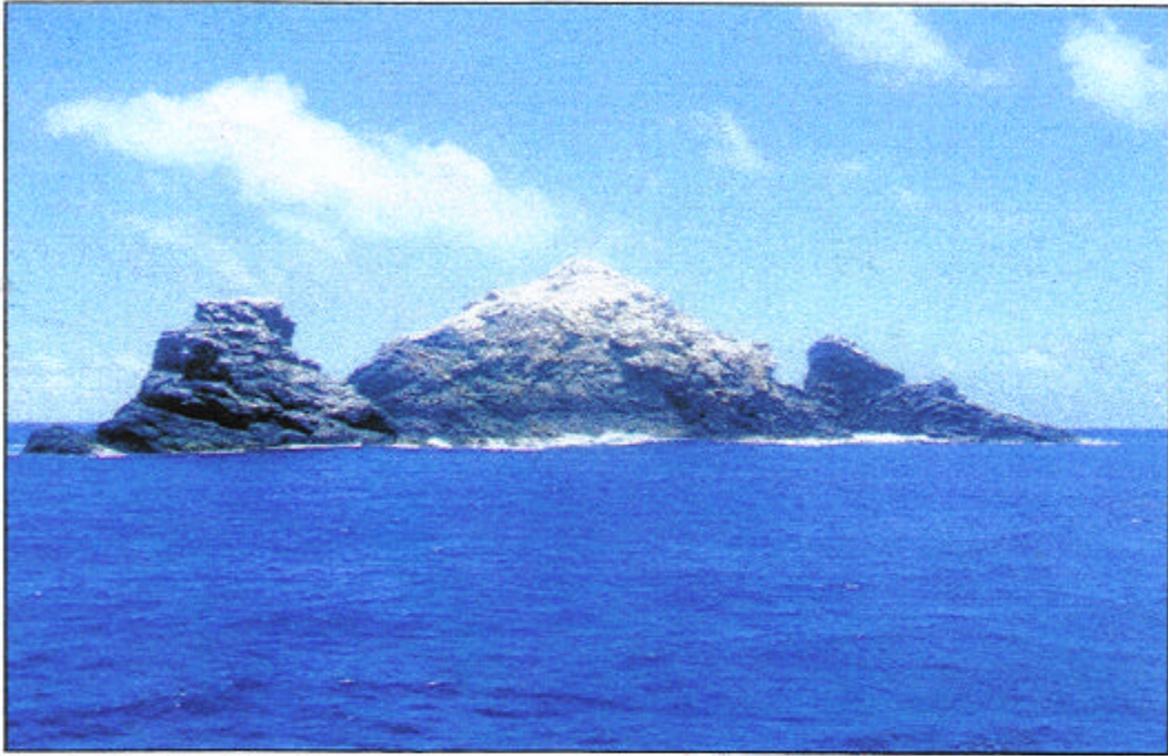
Fig. 1. Gardner Pinnacles, the oldest exposed piece of basalt in the Hawaiian Archipelago.