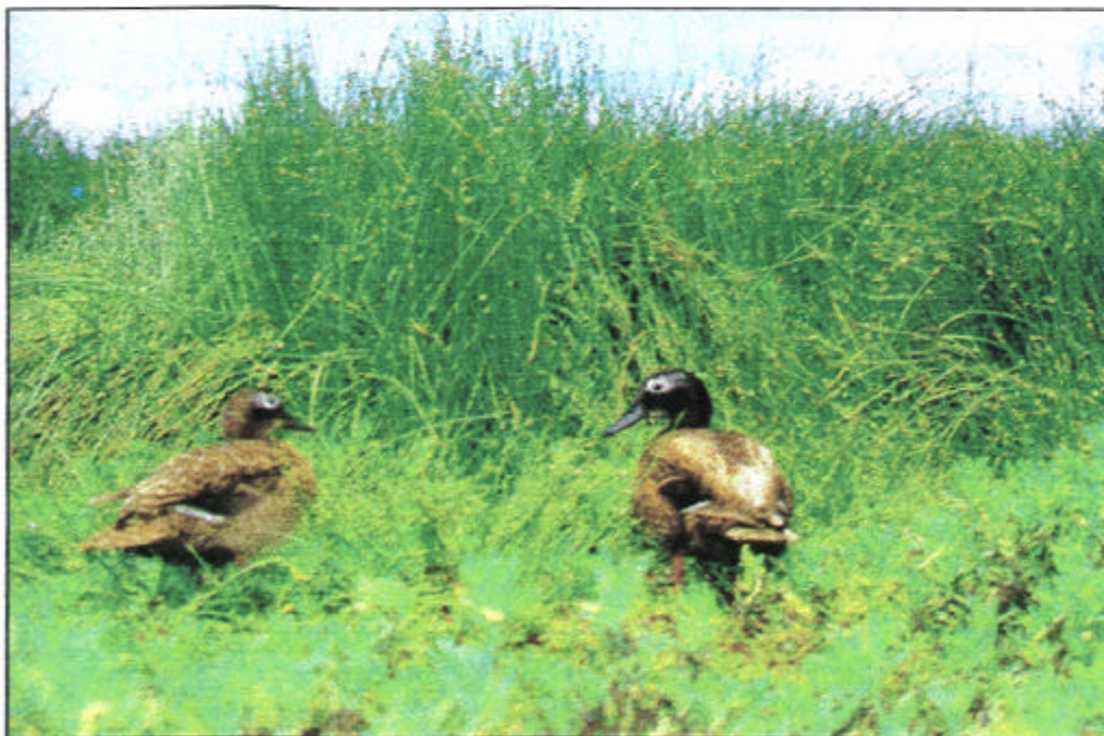
Fig. 10. Laysan duck with common lagoon vegetation Cyperus laevigatus , Heliotropium currasavicum , and Sesuvium portulacastrum – East side of lagoon, Laysan Island.