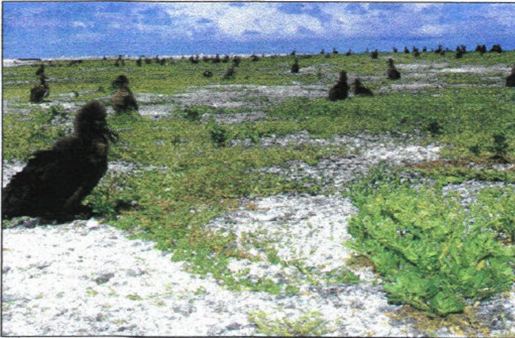
Fig. 18. Lepidium , Boerhavia repens , and black footed albatross, Southeast Island – Pearl and Hermes Atoll.