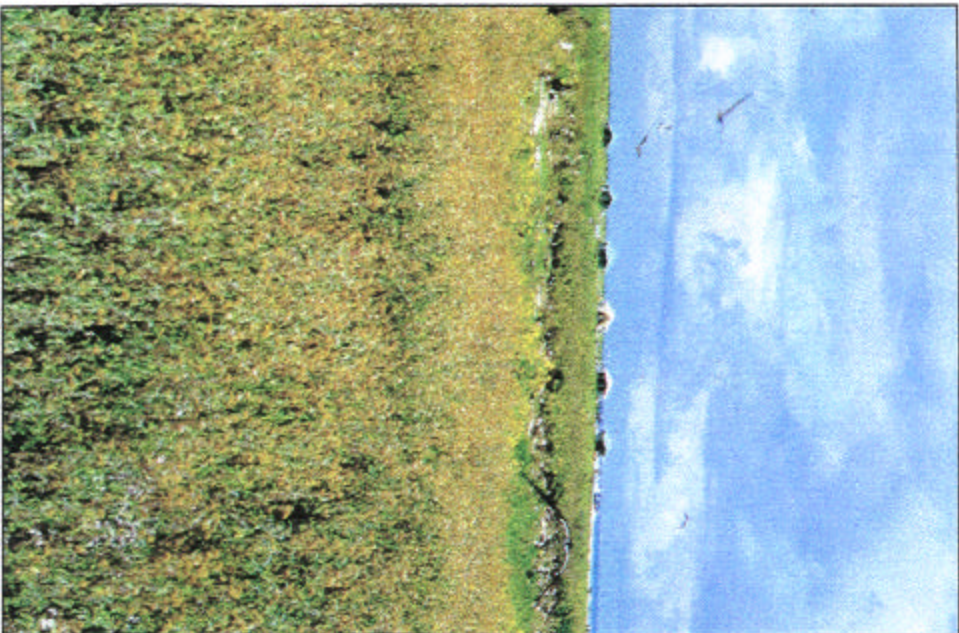
Fig. 21. Verbesina seeding with camp in background -- Southeast Island, Pearl and Hermes Atoll.