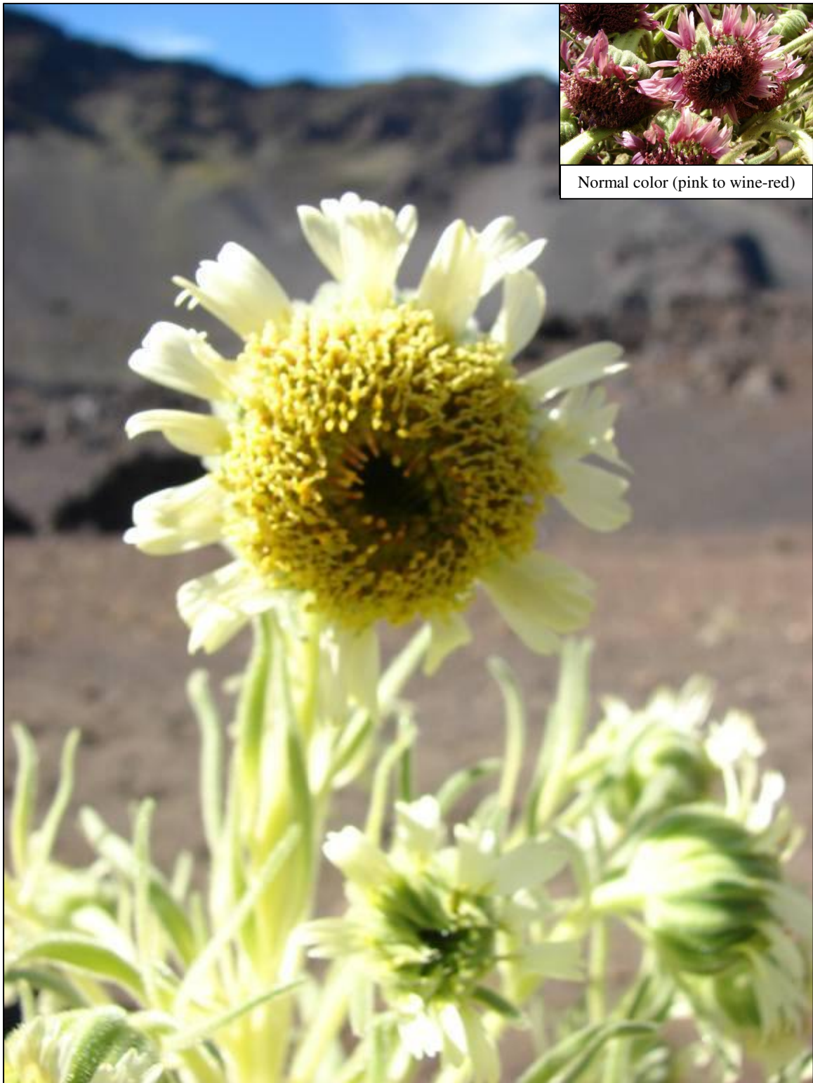
A rare yellow flowered silversword. Sliding Sands Trail. Oct. 2, 2007.