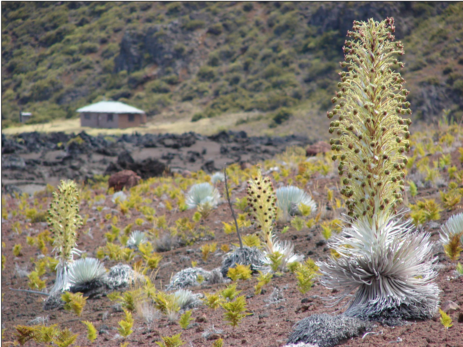
IMAGE FROM 2008 - Silverswords on Puu Kauaua with Kapalaoa Cabin in background.