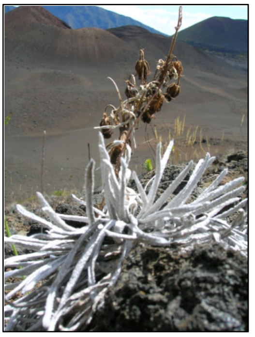
A small flowering silversword, on Puu Naue, one of the many small flowering silverswords observed this year.

A giant flowering silversword at the summit. Compare the number of "flowers" on this silversword with the small one to the right.